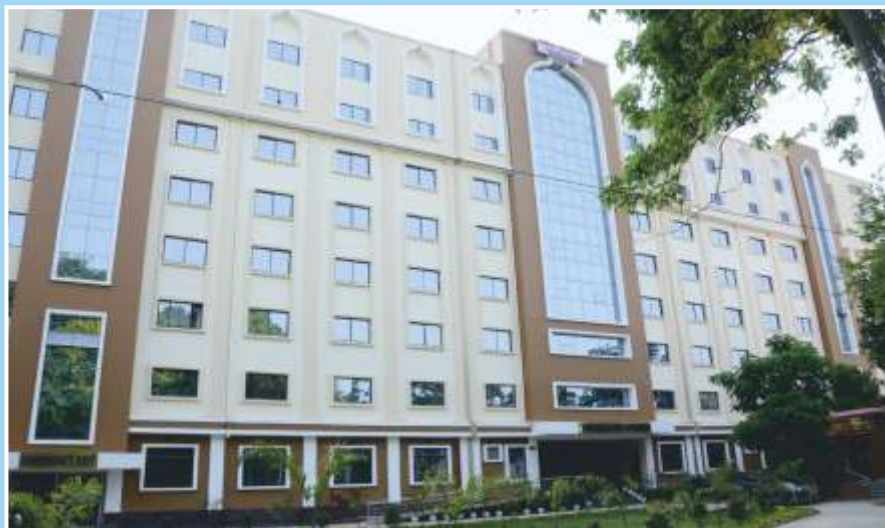
Mahima Hostel Magadh Mahila College

Printed by : Sanyam Publication, Patna : # 7004979511