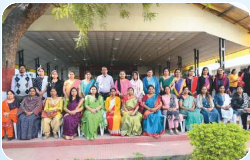
Principal with Guest Faculty