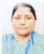
Ragini Kumari Central Library