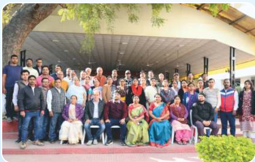
Principal with Non-teaching Staff