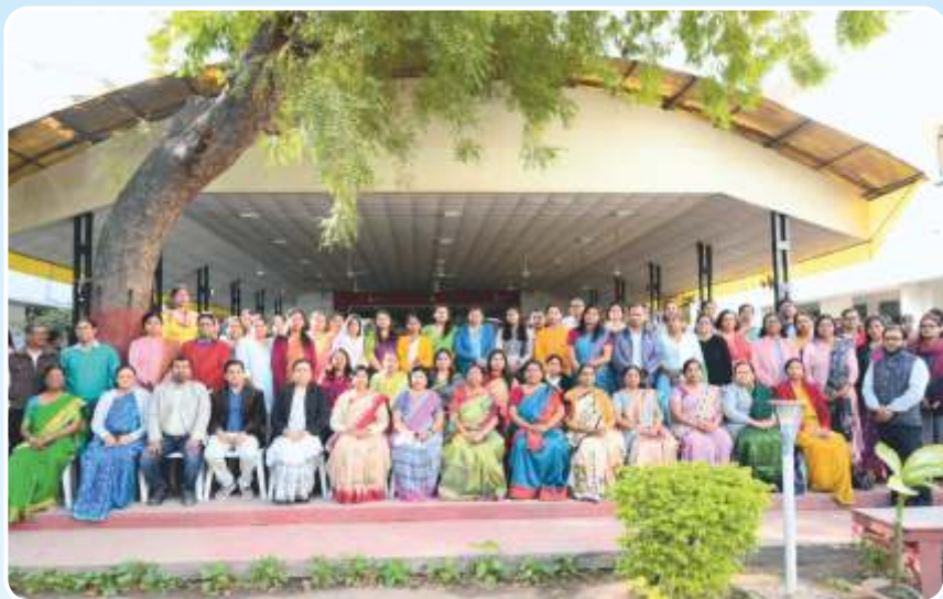
Principal with Faculty Members