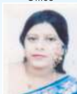
Dipti Chandra Central Library