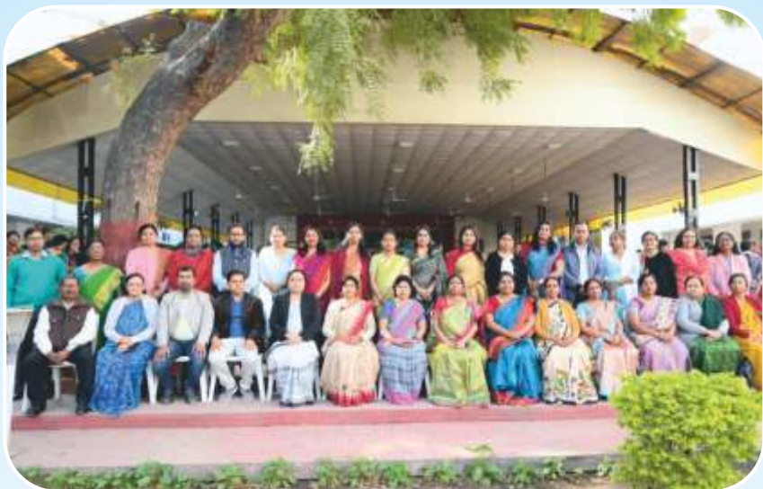
Principal with Regular Faculty Members