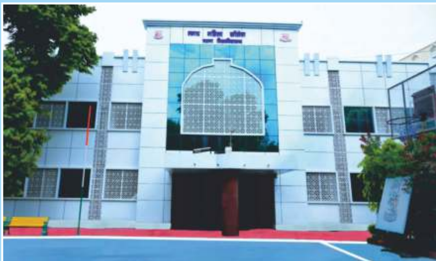
Magadh Mahila College