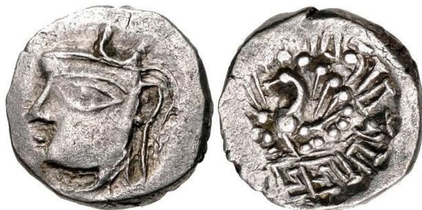
Coins of Harshavardhana