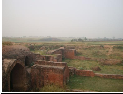
Ruins of Harsha-ka-tila