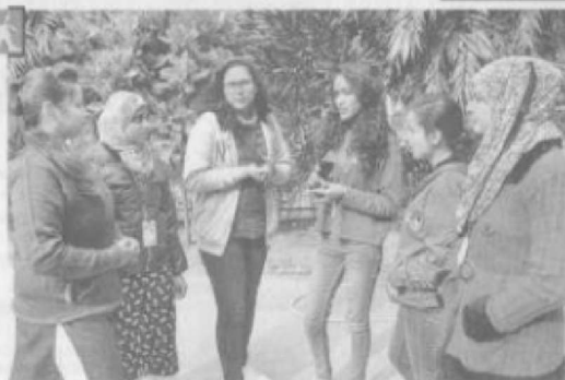
संस्था सचिव (पॉलिसी) ने आर्थिक सांख्यिकी विभाग तक संस्था में विद्यमान १२५११ कर्मचारी के आंकड़ों

सखारों स्कूलों को दया। सुखाने के लिए काफी सारी कोशिश की जा रही है। काउन्सिल इन्फो विभागों को निर्माण ठीक नहीं है। कहीं निर्माण को कमी है तो कहीं सुखाने की कलहा है। राष्ट्रपति को दैनिक जगहन ने अपने साप्ताहिक परिचय सुख जगहन के सुख भाग महिला कॉलेज की छात्राओं से 'संस्कृति स्कूल की निर्माण में कैसे आए सुख' विषय पर सुख है।