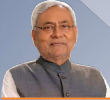
नीतीश कुमार माननीय मुख्यमंत्री, बिहार