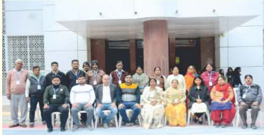
Principal with Regular Non-teaching Staff