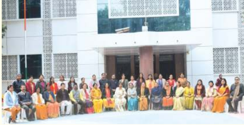
Principal with Regular Faculty Members