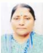
Ragini Kumari Central Library