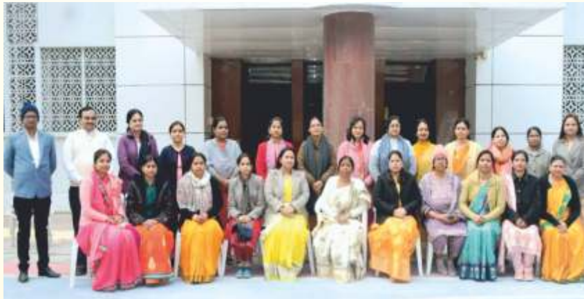
Principal with Guest Faculty