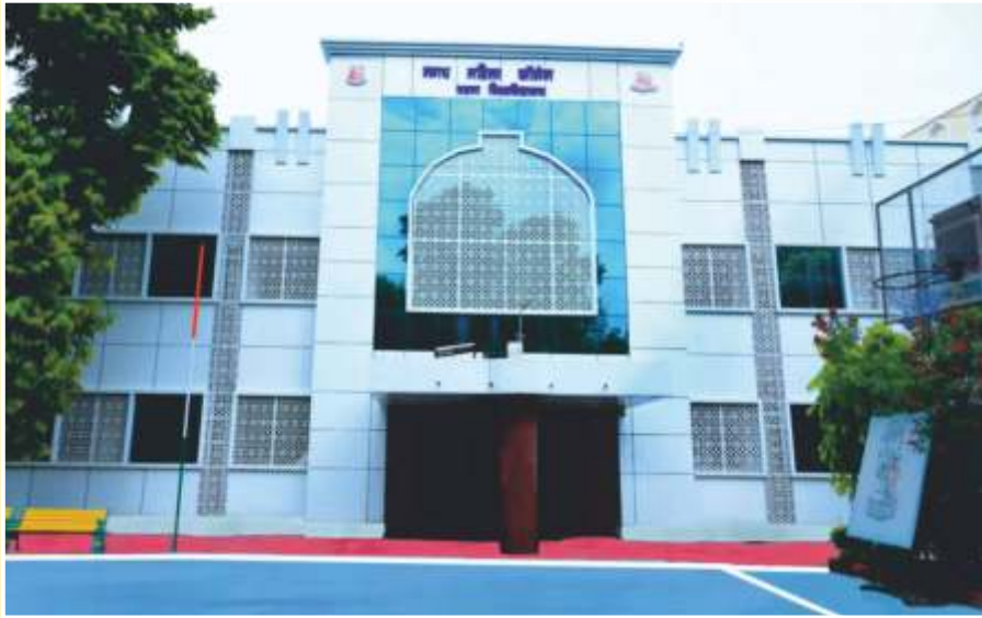
Magadh Mahila College