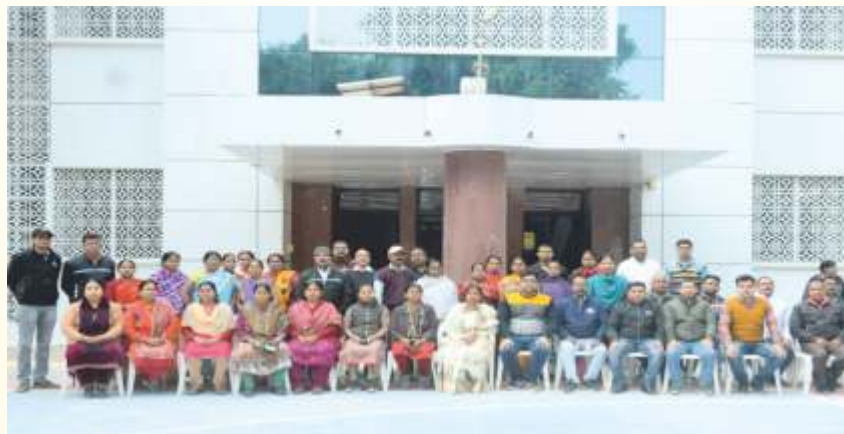
Principal with Outsourcing Staff