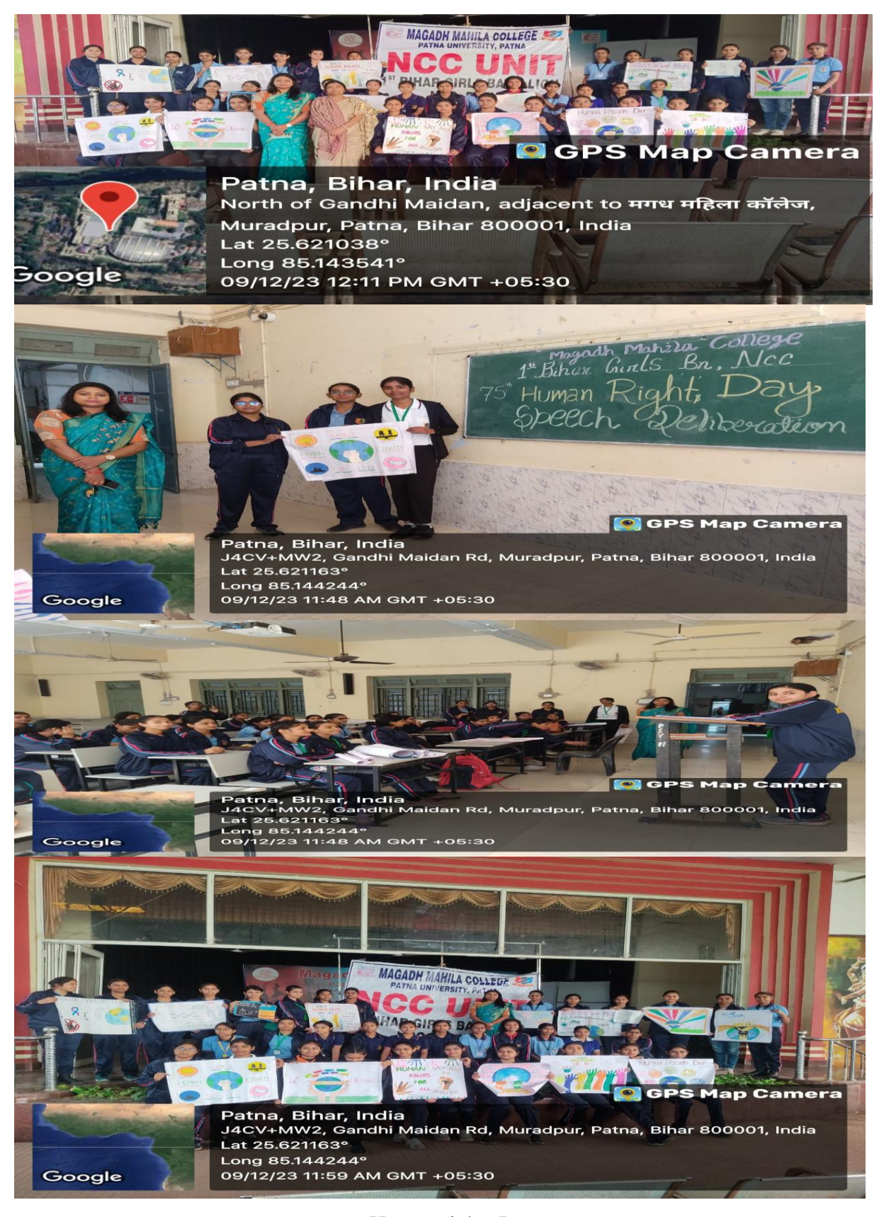
Human rights Day