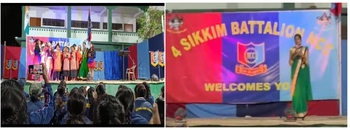
National Trekking Camp attended by <u>SUO Pallavi kumara</u>