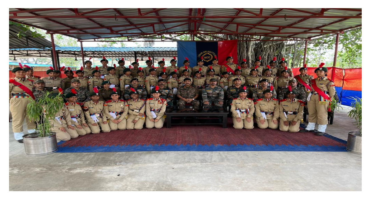
Independence Day 2023